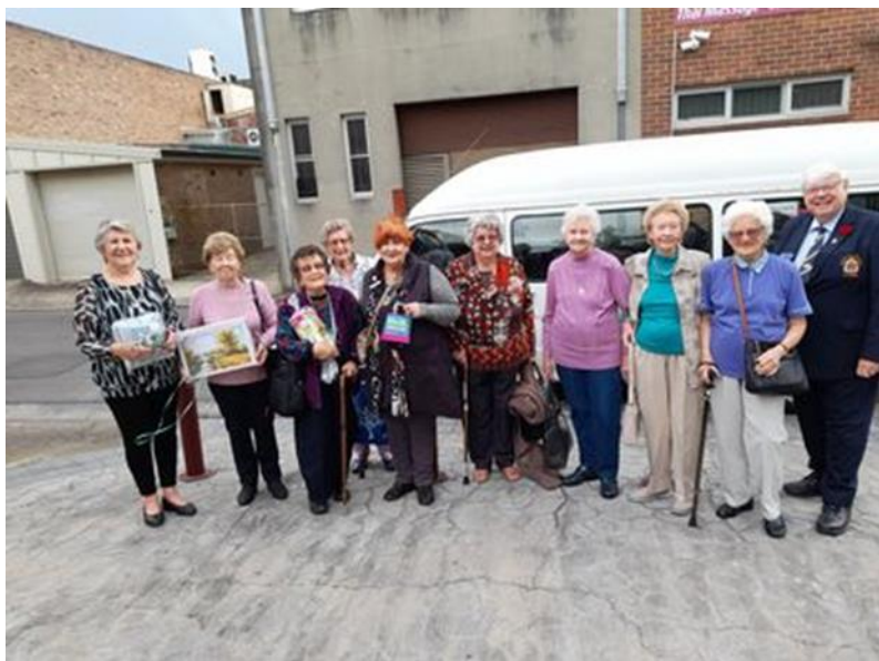
Bass Hill RSL Auxiliary members who attended Kingsgrove Auxiliary 70th Birthday function