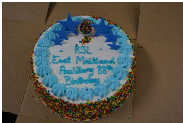
East Maitland sub Branch