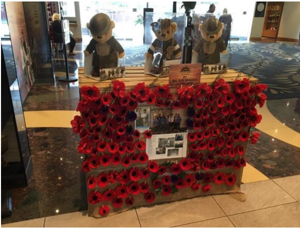
Poppies knitted by Auxiliary members